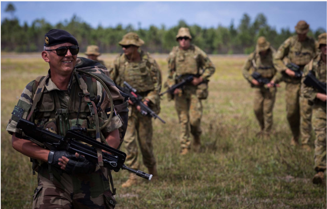
A French Armed Forces soldier leads Australian Army soldiers from the 2nd Battalion, Royal Australian Regiment to Ile Des Pins airport during Exercise Croix du Sud 2016 in New Caledonia, 13 November 2016.

France's defence- and security-related activities in the Asia–Pacific are often underestimated, sometimes distorted or simply ignored. The natural focus on the role of major powers in the region—the US, China, India and Japan—causes the contribution of a strategic actor, considered first and foremost as European and therefore an outsider, to be overlooked; however, this actor exercises global power at the diplomatic, military and economic levels, including in the Asia–Pacific region. The point here is not to overestimate France's strategic role in the region, but merely to recognise that after its role was diminished at the end of the first Indochinese conflict, France became involved again strategically in the early 1990s—a movement that has expanded in recent years. This reflects a lasting strategic realignment that can be seen in French defence policy and more tangibly at the regional level in operations, cooperation and dialogue.